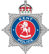
Kent Police Observer